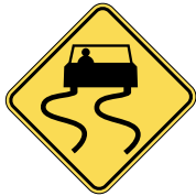
SLIPPERY WHEN WET