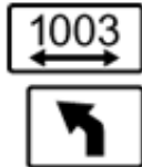
ADVANCE TURN ARROW