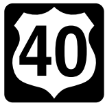
US NUMBERED ROUTE