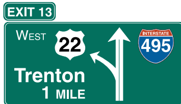
DESTINATION AND MILEAGE