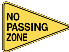
NO PASSING ZONE