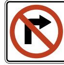
NO RIGHT TURN