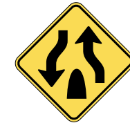
DIVIDED HIGHWAY ENDS